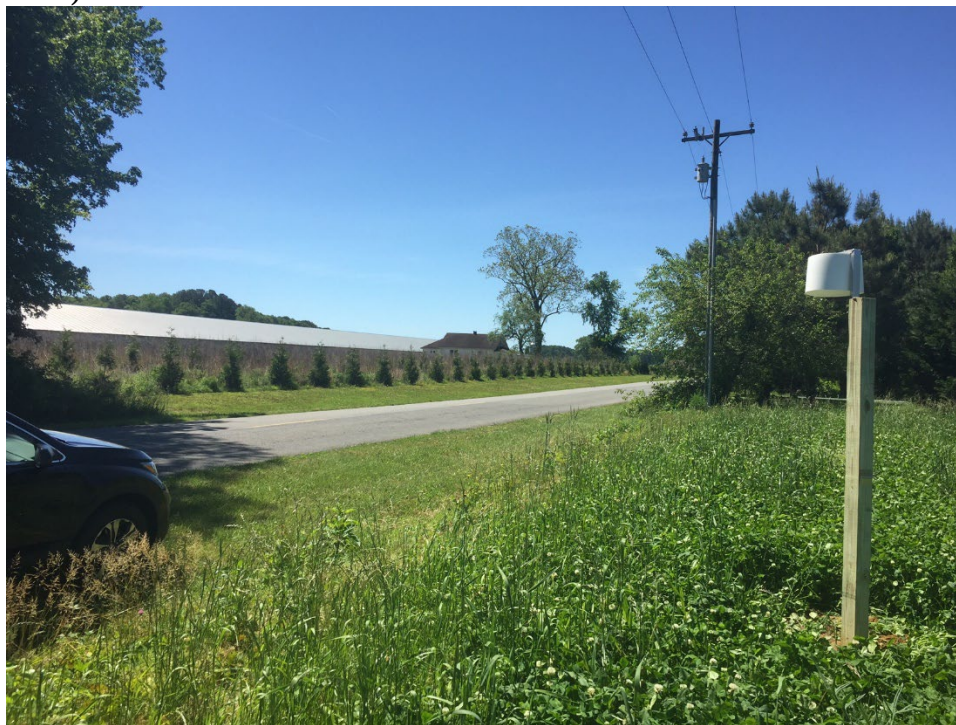
Picture A. EIP/ACT Site 2 (view of newly planted buffer in front of monitor, taken May 2017)

Monitoring data from Site 2 suggests that the efficacy of vegetative environmental buffers needs to be closely evaluated if the practice is going to be used to mitigate emissions and ammonia deposition. EIP monitored gaseous ammonia emissions in this location between May 2017 and August 2017 and resumed monitoring in the same location again with ACT in December 2020. In 2017, the closest poultry operation had a newly planted stand of evergreen trees (see picture A), and according to its Comprehensive Nutrient Management Plan, had installed a voluntary buffer. By 2020, that buffer of trees was much taller (see picture B), and we expected to measure lower ammonia concentrations as a result.