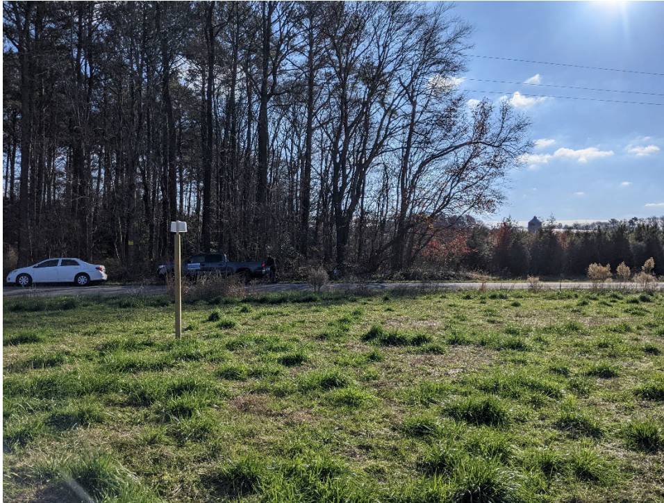
Picture B. EIP/ACT Site 2 (view of buffer, after three years of growth, in front of monitor, taken December 2020) 40

Table 3 below compares the average and range of concentrations at Site 2 detected in 2017 and in 2020-2021. The average two-week concentration was 33.1 ppb (with a concentration range of 9.93 to 87.74 ppb) in 2017, when the trees were just planted, but after three to five years of growth, when they were large enough to obstruct the view of the poultry house, the average two-week concentration was 35.8 ppb (with a range of 4.3 to 149.6 ppb).