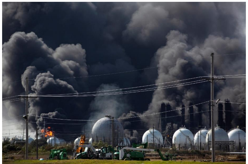
Smoke billows from a fire and explosion at the TPC facility in Port Neches near Houston in November 2019. The lack of penalties and enforcement in Texas increases the risk of accidents and pollution releases because companies have less of a financial incentive to upgrade their plants.

Illegal pollution releases during upsets are ubiquitous in Texas, in part because the TCEQ has been unwilling to require industry to do better. A 2017 report by the Environmental Integrity Project