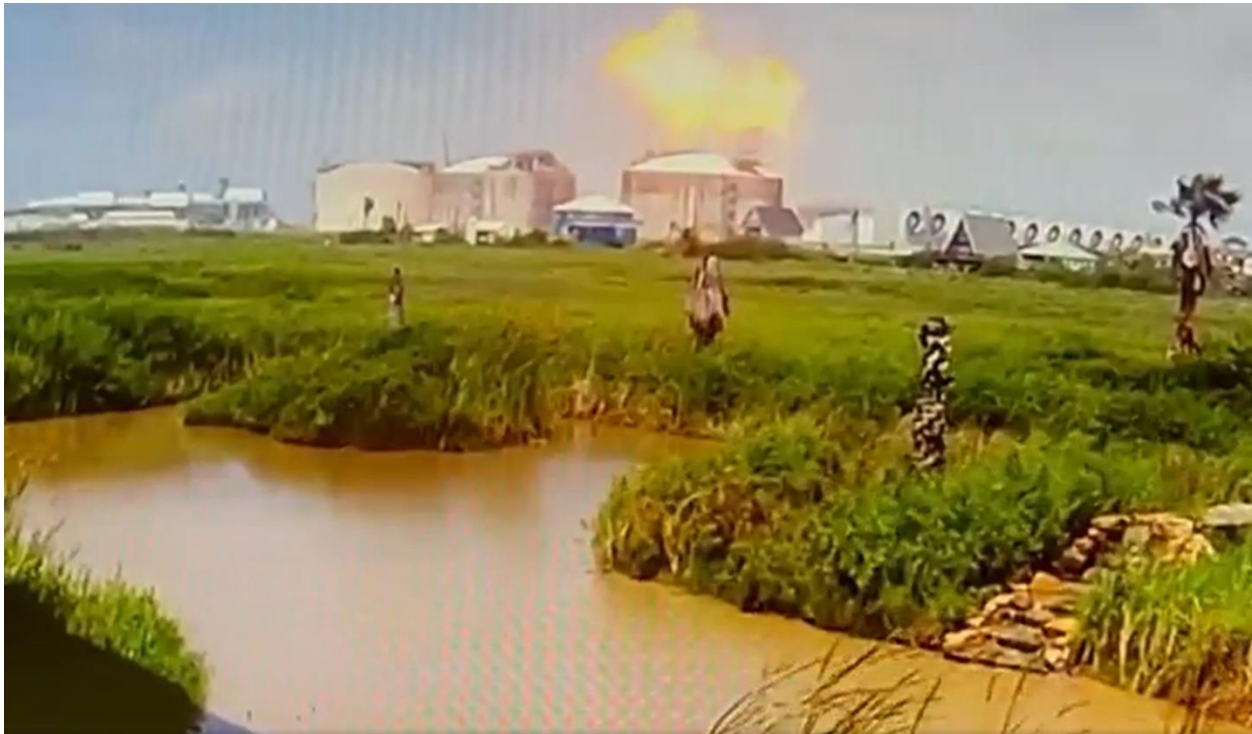
In June 2022, this explosion at Freeport LNG, south of Houston, was captured on video by a camera at a nearby beach.

units was not subject to the stringent offset and pollution control requirements that apply to major projects. In 2019, when those liquefaction units went into operation, Freeport LNG released nearly 119 tons of unauthorized nitrogen oxide pollution during 25 separate unexpected emissions events. In 2020, the liquefaction plant released another 103 tons of unauthorized nitrogen oxide pollution during unexpected emissions events. Thus, the TCEQ’s determination that construction and operation of these new units was safe was based on its consideration of nitrogen oxide emissions that accounted for less than three percent of the amount of pollution those units actually emitted during their first two years of operation. Moreover, none of that illegal pollution was offset with reductions at existing sources.