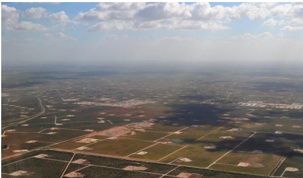
An aerial view of oil and gas well sites in the Permian Basin of West Texas.

6, even after issuing five warnings in a single year (2020) to the company for failing to report unexpected emissions events on time and even though the company's emissions events had violated applicable sulfur dioxide permit limits every year from 2015 through 2020.